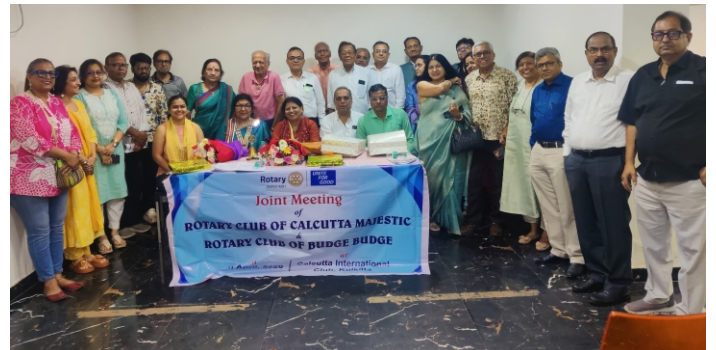
Group photo of members of both the clubs